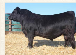
VISION OVERDRIVE 7001 FULL BROTHER TO LOT 28

A full brother to the $20,000 top selling Vision Overdrive 7001! He has the same length, muscle shape and large testes of Overdrive, but offers you an improved combination of marbling and ribeye traits. He represents 7 generations of predictable and proven calving-ease genetics without sacrificing performance, natural thickness, volume and structural integrity! His dam is proving herself to be a herd-bull producing machine with her first two natural sons. 8018 earned an impressive 97 birth ratio, 112 weaning ratio, 106 yearling ratio, 120 IMF ratio and 110 ribeye ratio.