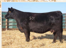
VISION PROUD LASSIE 531 DAM OF LOT 28

DOB: 1/11/18 | TATTOO: 8018 | REG. 19191278