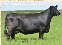
OH L ANGEL 217-2 DAM OF LOT 22

DOB: 1/15/18 | TATTOO: 8027 | REG. 19363430