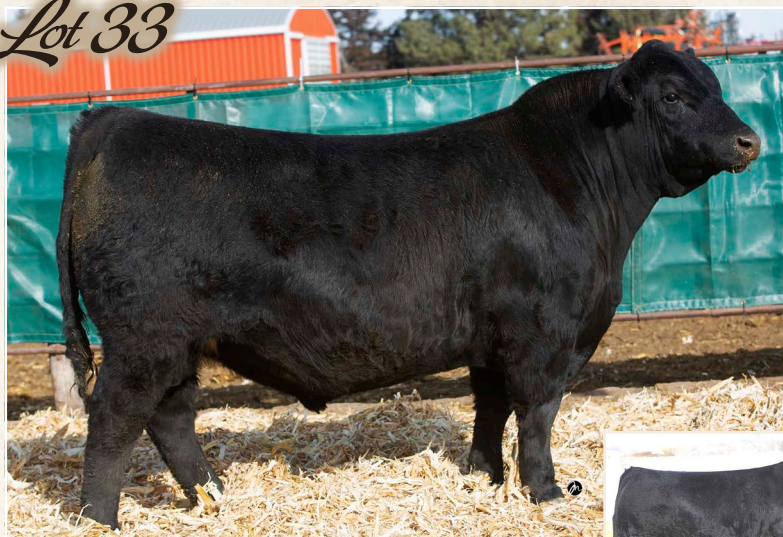
VISION UNANIMOUS 1418 SIRE OF LOTS 33-34