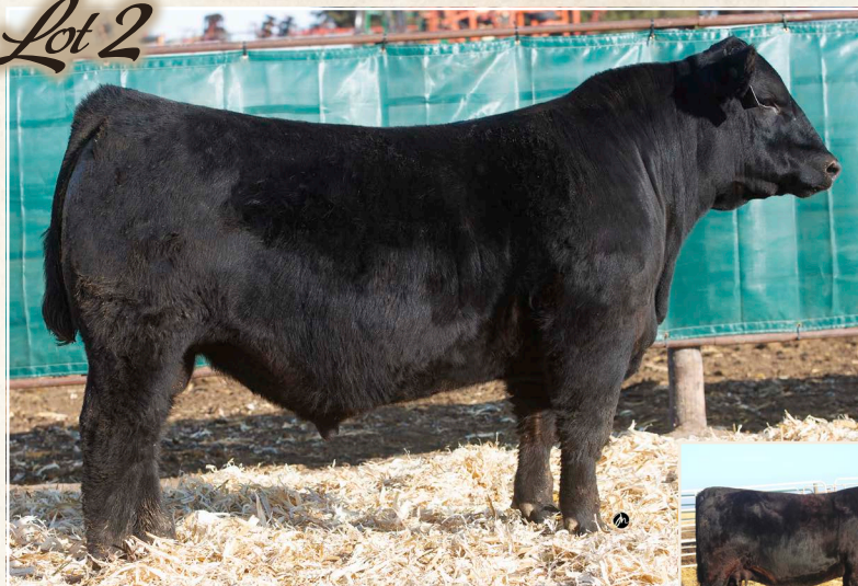
VISION EVERGREEN 610 DAM OF LOT 2