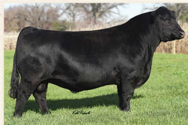
SAC CONVERSATION SIRE OF LOTS 41-43

Built for and recommended to use on your virgin heifers. This Conversation x Unanimous bred son will keep mature size in check while improving fertility, maternal function, carcass genetics and end-product value. He does a lot of things right in an older, more mature package that can get a lot of ground covered this summer.