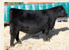
VISION WENDY 786 MATERNAL SISTER TO LOT 65

A calving-ease specialist in a moderate, functional package with athleticism and flexibility. His beautifully designed dam has produced females with tremendous body width and dimension. Many cattlemen can admire his maternal sister sired by Vision Unanimous 1418 that's pictured.