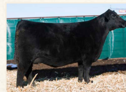
SELDOM REST SANDY 5089 DAM OF LOT 58

Just like his dam – truly a captivating individual from the side! Yet closer inspection reveals the extra three-dimensional mass, excellent muscle shape and fleshing ability you desire in your next calf crop. Trust the breeder that tells you his females and their udder quality will be superior. Here's a total package – moderate birth, performance, maternal function, fleshing ability and good looks!