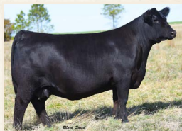
VISION LADY 432 DONOR DAM OF LOTS 49 & 50