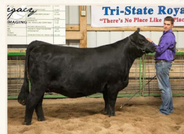
VISION PRIDE 666 DAM OF LOT 51

Predictable calving-ease genetics! The numbers combine with this bull's youthful head, smooth shape and build to provide you a heifer bull with predictability. The added bonus is improved carcass merit with increased marbling potential and a RE EPD in the Top 20% of the breed. The maternal function and udder quality of his dam is impressive making his heifers the keepin' kind.