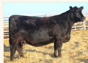
VISION EVERGREEN 610 DONOR DAM OF LOTS 1-3