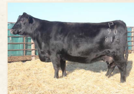
FLAG JESSICA 90812 DONOR DAM OF LOT 30

A balanced trait, heifer bull that has so much good to offer many cow herds! His donor dam is one of our favorites recording progeny ratios of weaning 5@104, yearling 4@102 and IMF 6@101. Be sure to check out his intriguing full sister featured as Lot 72. There's tremendous maternal value to be captured by keeping his heifers back as replacements. He boasts a strong EPD tabulation ranking in the Top 25% WW, 20% YW, 25% HP, 10% Milk, 15% CW, 25% RE, 10% $Weaning, 10% $Feedlot, 35% $Grid and 15% $Beef.