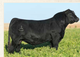
KCCI EXCLUSIVE 116E SIRE OF LOT 69

Style and power perfectly combined in this half-blood Simmental bull sired by KCCI Exclusive 116E – the $120,000 ½ interest high selling Simmental bull of 2018. His Unanimous dam and her flush mates are super attractive, moderate and big bodied females. He'll deliver the quality you expect with extra hybrid vigor, increased marbling potential and added thickness to produce those fancy, market topping feeder cattle.