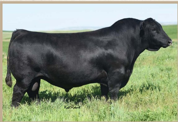
ELLINGSON CHAPS 4095