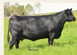
VISION EDELLA 665 MATERNAL GRANDAM OF LOT 19

A Five Star son that offers the right balance of fleshing ability, eye appeal, performance and three-dimensional mass. These Five Star sons are as uniform and consistent of a sire group as any you will find – a testament to our balanced approach to genetic selection and breeding. Backed by a grandam that produced Vision Unanimous 1418 and has earned an impressive progeny record of birth 6@97, weaning 6@102, yearling 5@103, IMF 8@107 and fat 8@104.