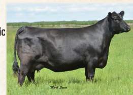
O H L ANGEL 2172 GRANDAM OF LOT 70

Stunning phenotype in this Angel heifer genetically designed to be classy and productive! She's a Limited Edition with no more Stunner semen on the open market. Her donor granddam blends impeccable phenotype and class with massive performance. Angel's picture accurately portrays her phenotypic excellence, production merit and superb udder quality that quickly propelled her to our donor program. Her daughters, the dams of Lot 12 and 70, are exceptional females that have captured the attention of all ranch visitors. Full sister in blood to Lot 12.