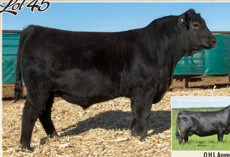
O H L Angel 2172 Grandam of Lot 45

DOB: 1/3/21 • TATTOO: 1006 • REG. 20110844