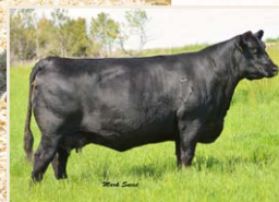
Vision Edella 665 Grandam of Lot 21 & Dam of Vision Unanimous 1418

Extra pounds, performance and three-dimensional mass with more milk and marbling potential is what you can expect from Lot 21. His Pathfinder grandam recorded a BR 6@97, WR 6@102, YR 5@103, IMF 8@107 and Fat 8@104. He's in the Top 30% WW, 25% Milk, 10% Marb, 20% $G and 25% $B.