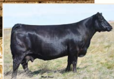
Vision Evergreen 022 Dam of Lot 79

The closer we get to the sale ... the more Brent says we shouldn't be selling this heifer! An elegant Evergreen with exquisite femininity, body depth and maternal presence. Our Payweight Plus daughters in production are stunning – moderate, easy keepin' with picture perfect udders. Add productivity and longevity from the Evergreen family and you have a great cow prospect! Backed by a 12 year-old dam still in production and a Pathfinder grandam that earned a WR 7@103, YR 6@102, IMF 18@103, RE 18@102 and Fat 18@109. She offers unlimited breeding potential with EPDs in the Top 20% CED, 25% BW, 5% Milk and 15% $W.