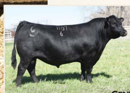
Sitz Alpine 11076 Sire of Lots 61-62

An impressive Sitz Alpine son in the pen and on paper! He offers a strong genetic package and an EPD tabulation that can add value to many programs regardless of your end target. You'll appreciate his length, athleticism, quite disposition and EPDs that rank in the Top 20% WW, 25% YW, 30% SC, 3% HP, 1% CEM, 20% Doc, 30% Angle, 25% Marb, 2% $M and 15% $C.