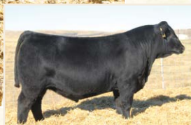
SAV Pattern 6926 Sire of Lot 71

The youngest bull in our sale offering loaded with performance, maternal function and genetic potential – imagine this bull with two more months of growth and maturity! We're confident his daughters will be the keepin' kind as he's backed by one of our favorite young females and Pattern daughters in production are recording an average 104 weaning ratio. His EPDs rank in the Top 20% WW, 25% YW, 30% SC, 15% HP, 10% Milk, 25% PAP, 15% $M and 10% $W.