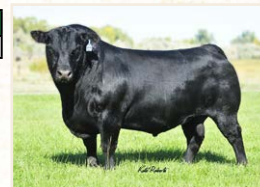
LD Capitalist 316 Sire of Lots 63-65

An age advantaged Capitalist son whose grandam, Baldridge Isabel Y69, anchored the Baldridge program. He's moderate and massive with exceptional body dimension and rib shape. His EPDs rank in the Top 10% WW, 15% YW, 15% Milk, 15% Claw, 30% Angle, 15% Marb, 4% $W, 15% $G, 30% $B and 25% $C.