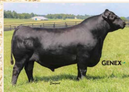
Connealy Mainstay Sire of Lot 49

Here's a reliable, calving-ease bull that will have many friends Monday, March 7th! Phenotypically he's an easy one to find in the pen with his impressive looks, tremendous length and extra body dimension. His sire, Connealy Mainstay, is above breed average for all those economically relevant traits and is backed by one of the leading donors at Connealy Angus. He ranks in the Top 15% CED, 10% BW and 20% Doc.