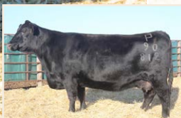
Flag Jessica 90812 Grandam of Lot 55

DOB: 1/22/21 • TATTOO: 1035 • REG. 20110855