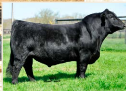
HPF Quantum Leap Z952 Sire of Lot 72

Here's a gentle, moderate, powerful, stout-featured 3/4 blood Simmental bull! He's backed by a rock-solid Steel Force daughter that's super attractive, fertile and easy fleshing with excellent udder quality. His sire Quantum Leap continues to be one of the exciting purebred Simmental bulls that combines calving-ease and maternal traits with exceptional phenotype and body dimension. Lot 72 is bred to deliver the quality you expect with extra hybrid vigor and added thickness to produce those black, fancy, market-topping feeder cattle.