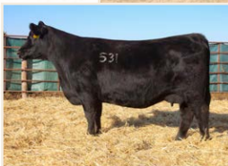
Vision Proud Lassie 531 Dam of Vision Overdrive 7001

Mytty In Focus # A A R Lady Kelton 5551 # S A V Bismarck 5682 # S A V Madame Pride 9100 Sitz Dimension 8607 # Sitz Forever Lady 6121 # S A V Final Answer 0035 # Vision Proud Lassie 726