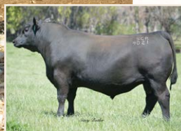
Spring Cove Reno 4021 Sire of Lot 60

An 18-month-old, elite herd bull prospect with the genetic credentials to be worthy of your consideration! He offers the most unique and impressive EPD profile in the offering ranking in the Top 10% BW, 20% YW, 3% HP, 5% Milk, 30% Doc, 30% Claw, 1% Marb, 10% $M, 10% $W, 1% $G, 10% $B and 4% $C. You'd expect nothing less being a grandson of the famed Baldridge Isabel Y69 and sired by Reno – the only proven Angus sire that ranks 4% WW, 10% YW, 1% HP, 20% Milk, 10% Marb, 25% RE, 1% $M, 1% $W, 5% $G, 20% $B and 3% $C.