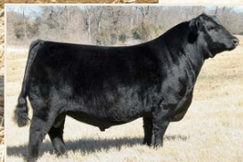
5T Power Chip 4790 Sire of Lots 69-70

The final age advantaged bull in our offering with double-digit calving ease and a puppy dog disposition! His EPDs rank in the Top 15% CED, 15% CEM and 30% PAP. His sire 5T Power Chip 4790 is known for producing cattle with great phenotype, extra natural dimension, athleticism and a super disposition.