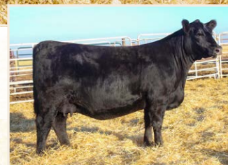
Vision Evergreen 610 Dam of Vision Payweight Plus 9019