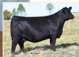
Vision Lady 432 Grandam of Lot 43

Without a doubt, Overdrive delivers predictable calving-ease without sacrificing performance and maternal function. You can expect this Overdrive son to do the same. You can also expect impressive phenotype, superior fertility and added carcass value as he's backed by our Lady family. He boasts impressive EPDs ranking in the Top 20% CED, 30% WW, 15% YW, 30% HP, 15% CEM, 4% Milk, 20% CW, 10% RE, 15% $W, 15% $F, 20% $G, 15% $B and 20% $C.