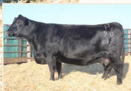
Flag Jessica 90812 Dam of Lot 15

DOB: 1/8/21 • TATTOO: 1010 • REG. 20113702